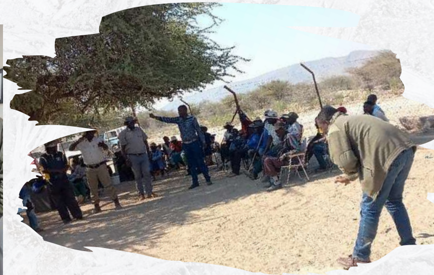
Scoping visit to communal conservancies in the Kunene region